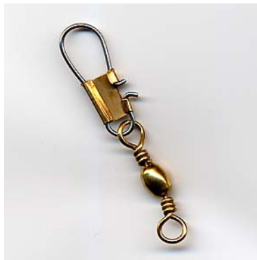
FIGURE 2 - SIZE 3 BRASS BARREL SWIVEL AND INTERLOCK (Sample brand “Seahorse” – approximately full size)

(Please note this drawing is to be updated to reflect a gradient in the first panel)