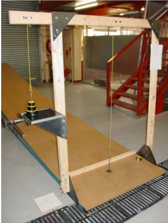
FIGURE FAQ 11b - UNSW@ADFA Trapdoor and Gantry Arrangement