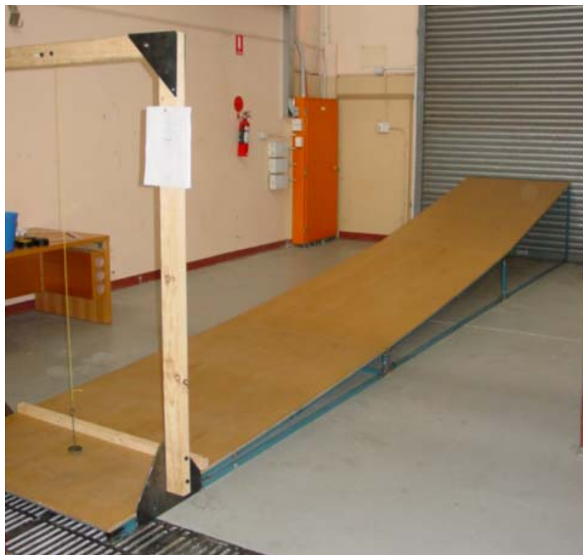
FIGURE FAQ 11a - UNSW@ADFA Track

The following photos are of the track fabricated for the UNSW@ADFA campus competition. The gantry arrangement utilises some ball bearing 20 mm single pulley blocks (Ronstan brand) sourced from a local ship-chandlery and 2 mm “spectra” cord also sourced from the chandlery.